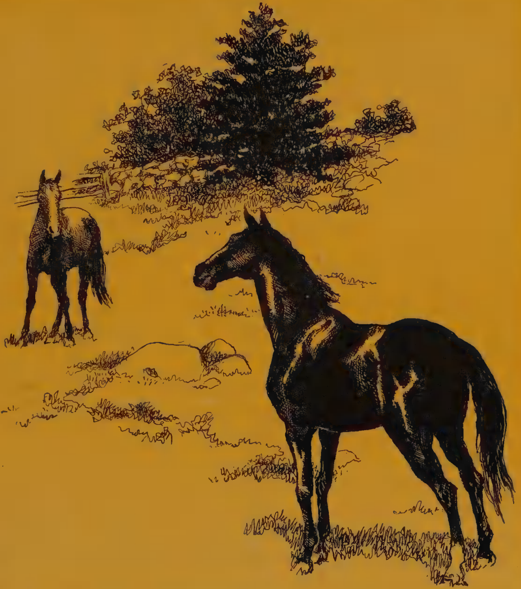
Who should come in but dear old Ginger